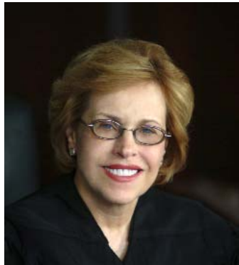
Chief Justice Marilyn Kelly.

Curriculum materials are included with the program. The materials and webcast are available at: